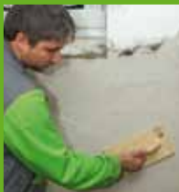
Smoothing the surface

Apply KÖSTER Polysil® TG 500 as a primer in order to strengthen the substrate and reduce the mobility of the salt molecules. KÖSTER restoration plasters are available in grey or white. In historic buildings they can be used as a decorative plaster even without painting. They are suitable for interior and exterior use.