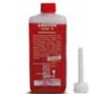
KÖSTER Crisin® 76