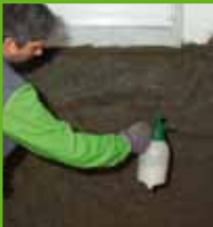
Priming with KÖSTER Polysil® TG 500

KÖSTER restoration plasters are especially designed for the restoration of masonry with high salt and moisture contents. They are also not affected by high salt contents and prevent salts from diffusing to the surface. When rising damp is stopped with KÖSTER Crisin® 76, KÖSTER restoration plasters help to dry out the wall and absorb remaining salts. KÖSTER restoration plasters withstand moist conditions since they do not contain lime or gypsum. They are open to water vapour diffusion and help to create a healthy and comfortable room climate.