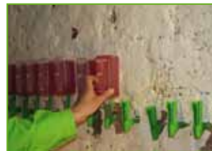
Installation of the cartridges