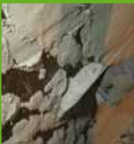
Application of KÖSTER restoration plaster