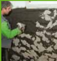
Application of the KÖSTER plaster key