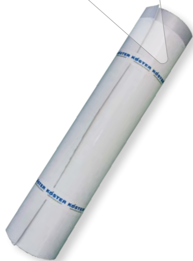
KÖSTER TPO SK (FR) Membrane